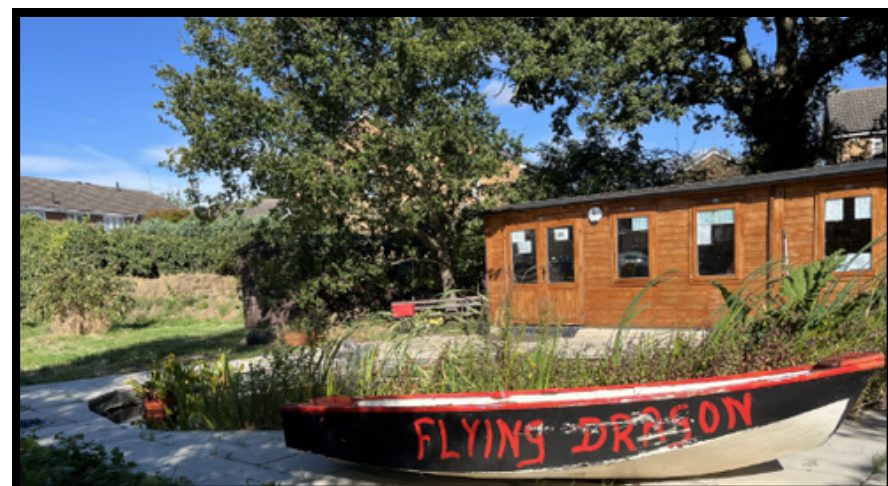
The evolving pond area next to our Forest School area.