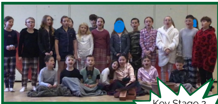
Key Stage 2 Poetry Slam Champions- Jaguars