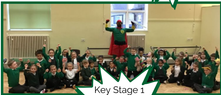
Key Stage 1 Poetry Slam Champions- Foxes