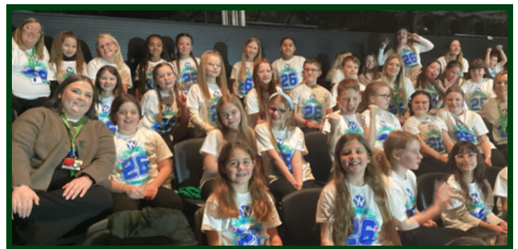
The choir at Young Voices 2026

On Thursday, some of the Year 4, 5, 6 girls took part in a football tournament at Nene Park Academy. It was a county qualifier event and the girls have now qualified to play at county level in Cambridgeshire. Well done to all of the girls who took part!